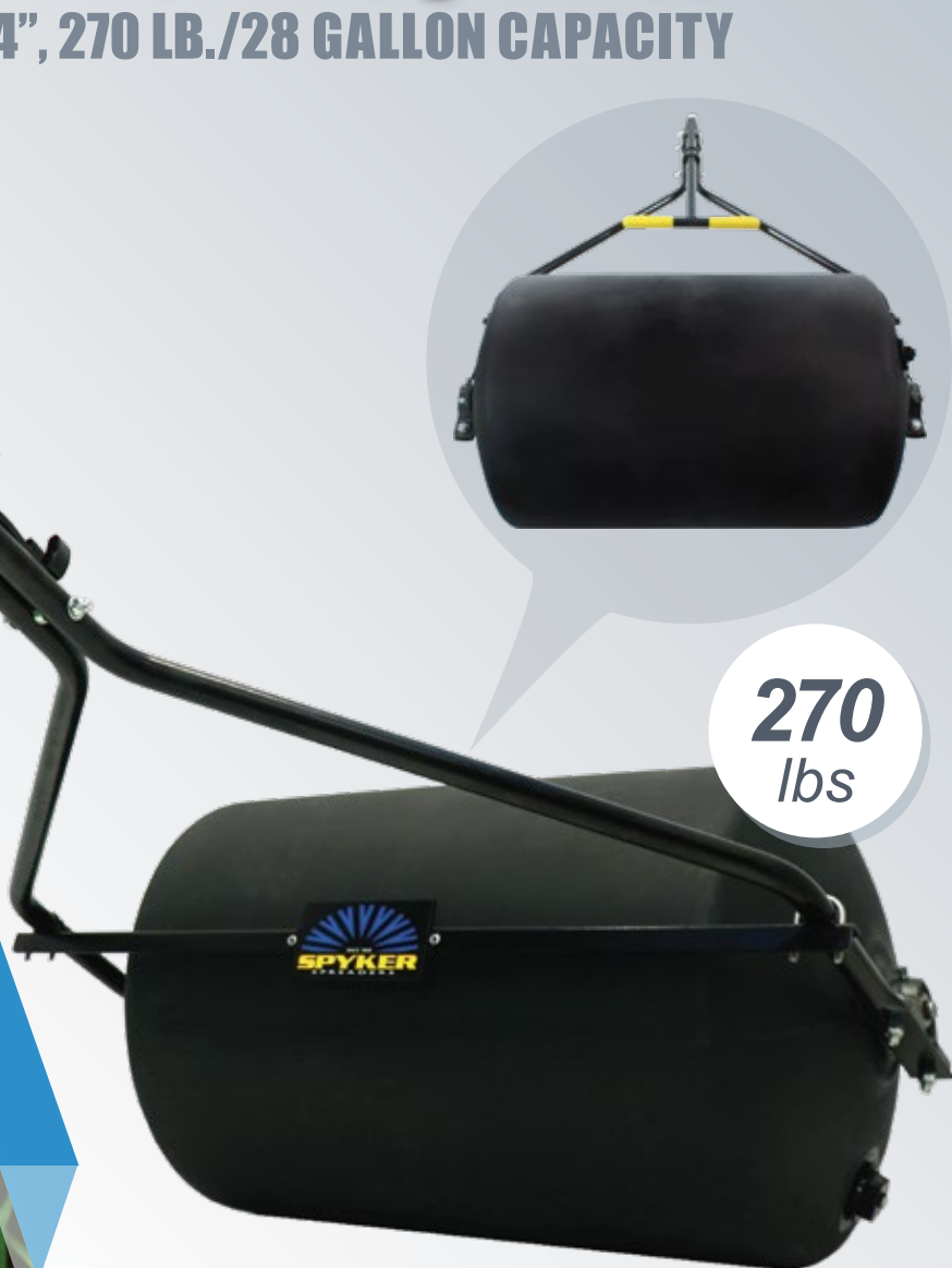
R28-1824 Commercial Push/Tow Poly Lawn Roller