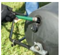
Extra-Large Fill Opening