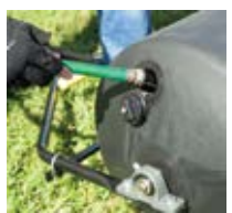
Extra-Large Fill Opening