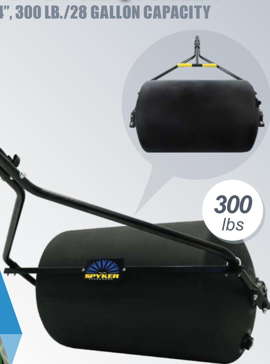
R28-1824 Commercial Push/Tow Lawn Roller